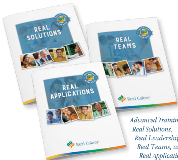
Advanced Training: Real Solutions, Real Leadership, Real Teams, and Real Applications.

Using this powerful knowledge, your participants will develop more effective communication skills and build better relationships, in and out of the workplace.